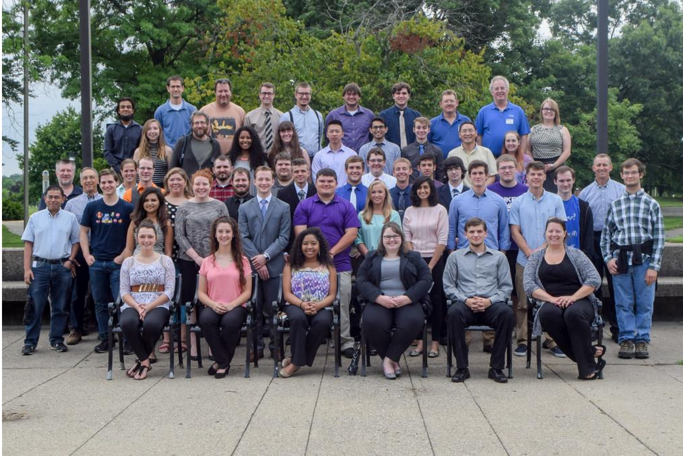
SURE 2016 Participants

Summer Undergraduate Research Experience (SURE) Program